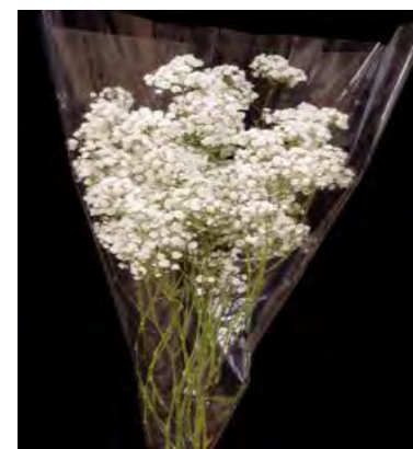
Gyp Snow White